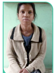
After Nutritional support